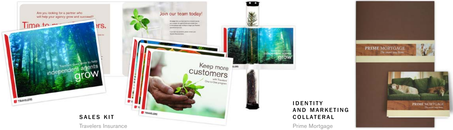
SALES KIT Travelers Insurance