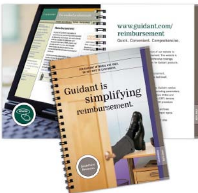
GUIDEPOINT BROCHURE Guidant Corporation